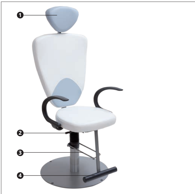
Fig. 1. ATMOS® Chair 21 P with selectable option rigid foot support