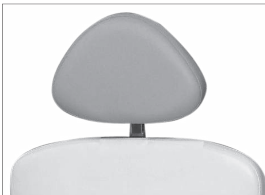
Fig. 6. Turning the headrest

The headrest can be completely folded backwards and then removed from the support (Fig. 6).