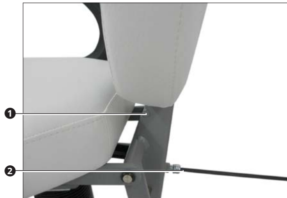
Fig. 4. Fixing the backrest