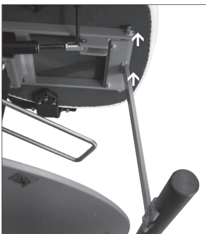
Fig. 3. Fixing the foot support

The patient chair is anchored by means of the enclosed fixing set. To do this the cover plugs must be removed from the fastening drillings and the chair must be anchored to the floor with the plugs and screws (Fig 2).