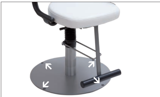
Fig. 2. Drillings for anchoring the base plate