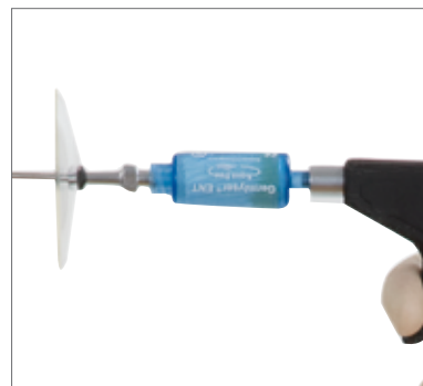
6 Hygiene filter for water flushing