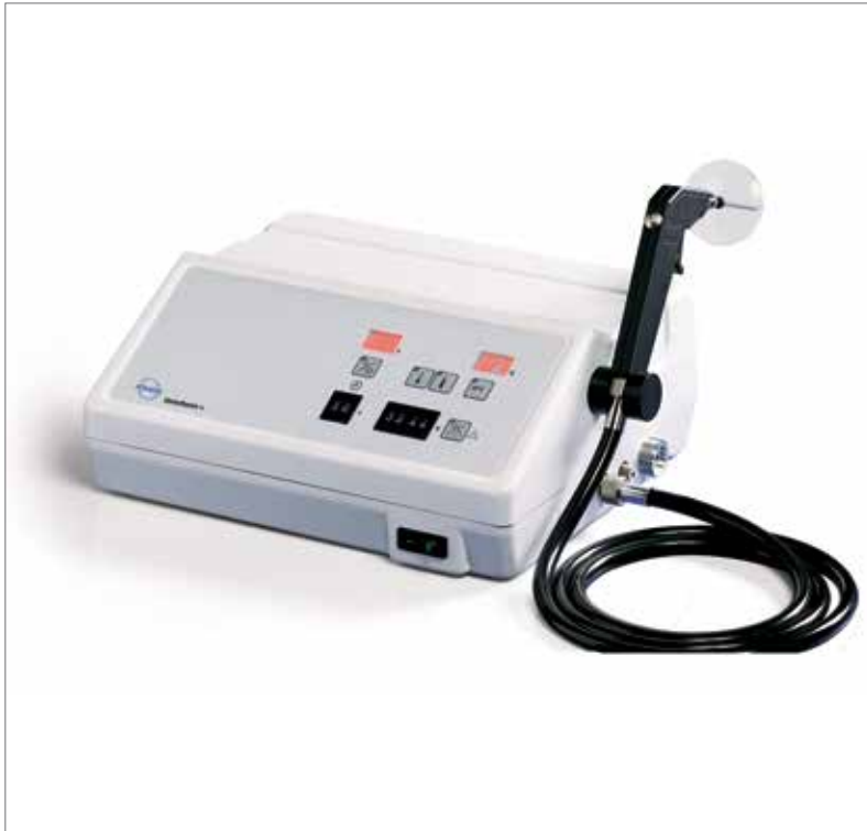
1 ATMOS® Variotherm plus