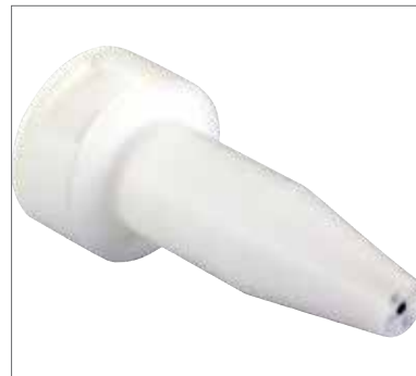
3 Rinsing connection for thermic stimulation