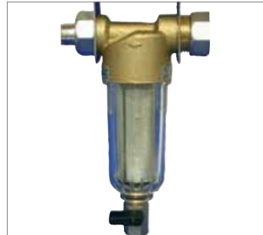
2 Water prefilter for ENT units