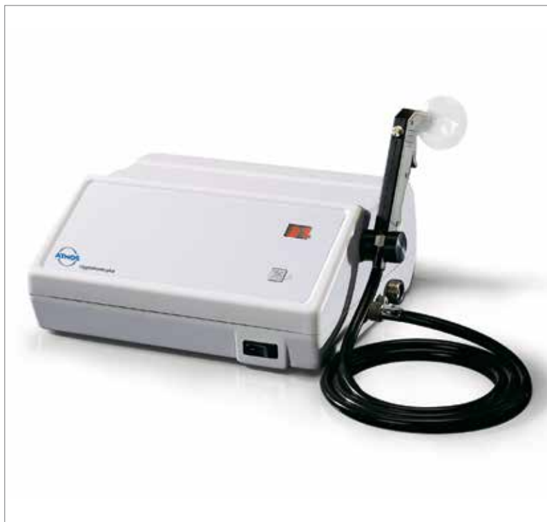
1 ATMOS® Hygrotherm plus